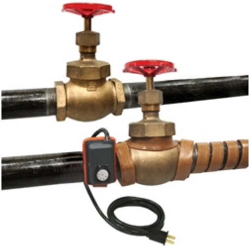
Silicone Rubber Heating Tapes with Thermostat